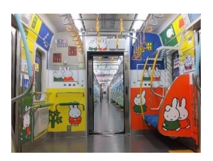
miffy and dan © Mercis by