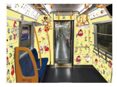
Daruma-chan and Tengu-chan