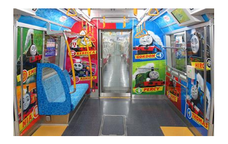
Thomas the Tank Engine

The Bureau of Transportation of the TMG has been operating trains with "Childcare Support Space" on every Toei Subway line to help passengers traveling with small children use the trains more comfortably and free from worries.