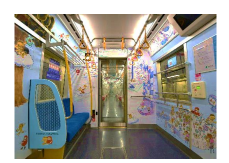
Daruma-chan and Kaminari-chan