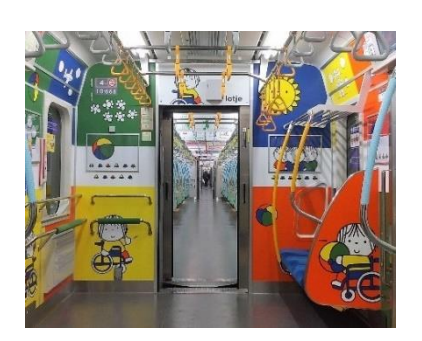
lotje © Mercis bv