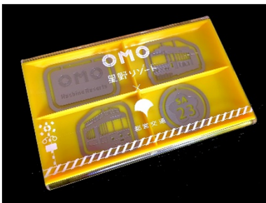
Images on paper